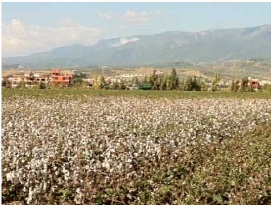
A view of a cotton field in Hatay

In Turkey there are approx. 15 cotton varieties of which five are responsible for 80% of total cotton output.