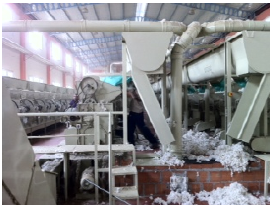
A large roller gin installation

The share of roller-ginned cotton increased since the last visit of the Spinners Committee in 1999 from 95% to 99%. The Committee recommends in general roller-ginning as the intrinsic properties of the cotton fibers are better preserved as compared to saw-ginning.