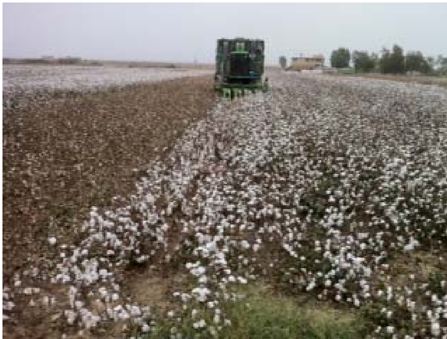
A cotton picking machine at work

So the Committee was distressed to observe the very poor quality of the machine picking, the seed cotton being full of green leaves and bark and whilst the few farms visited which were still hand picking, the quality was no better, as is traditionally the case, since the pickers were picking the cotton together with a lot of dry leaves, green leaves and even the complete stalks – a very unusual reversal of the previous situation.