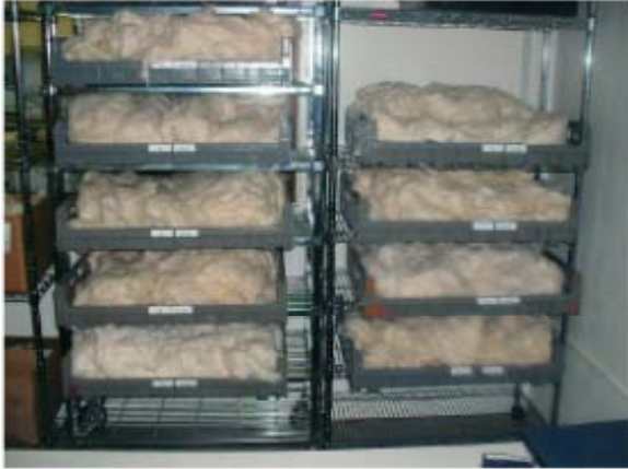
Figures: Storage of samples for conditioning [Uster]

(Recommendations) It is important to undertake regular checks of the moisture content of the cotton samples. For Upland cottons, the moisture content should not exceed the range of 6.75 to 8.25% (dry basis) and should not vary by more than 1 percentage point from that of the Calibration Cottons. Out of range samples should be allowed additional conditioning time. If the range is still not achieved, then the sample should be marked as exceptional.